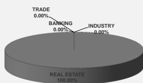
BEIRUT STOCK EXCHANGE DAILY TRADING VOLUME